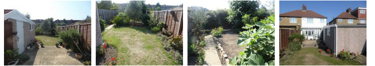
Concrete area with shrub borders, side access, rest laid to lawn area with mature shrub and flower borders, pathway leading to further area with fruit trees and mature shrub borders.