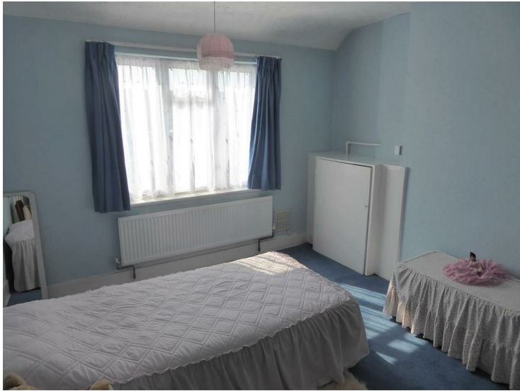
Rear aspect double glazed window, radiator, airing cupboard housing tank, radiator.