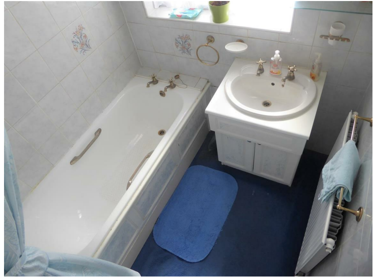
Panel enclosed bath with wall mounted "Triton" shower unit, wash hand basin with vanity unit below, tiled walls, radiator, rear aspect double glazed window.