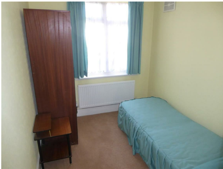
Front aspect double glazed window, radiator, power point.